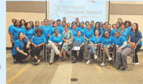
Figure 5. Attendees of the Interprofessional Team Best Practice Champion Open-House – 2024.