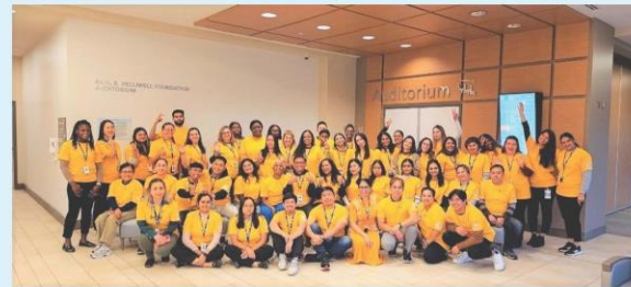
Figure 2. Attendees of the Interprofessional Team Best Practice Champion Open-House – 2023.